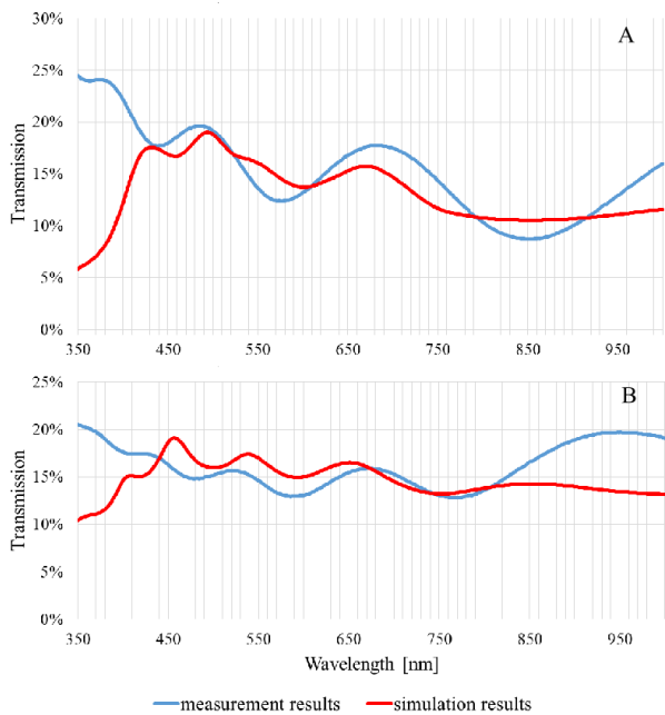
Fig. 3. Measurement and model transmission spectrum of the tested samples :A. NCD-1, B. NCD-2.