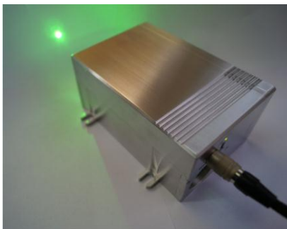
Fig. 1. Prototype of a femtosecond laser with graphene-based saturable absorber (top), prototype of a single-frequency green laser – project for the European Space Agency (bottom).