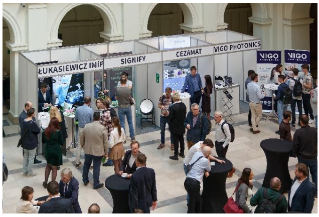
Fig. 7. 2nd International Photonics Job Fair.

2nd International Photonics Job Fair, co-organized jointly with Polish Technological Platform on Photonics, gathered leading Polish photonics exhibitors (companies): VIGO Photonics, Łukasiewicz IMIF, Seargin, Fluence, Sygnis, Ensemble3, SHM System, FIBRAIN, Signify, CEZAMAT, and representatives of Berlin-Brandenburg Cluster OpTecBB (Fig. 6). FIBRAIN was chosen by students as the most attractive presenter of the Fair.