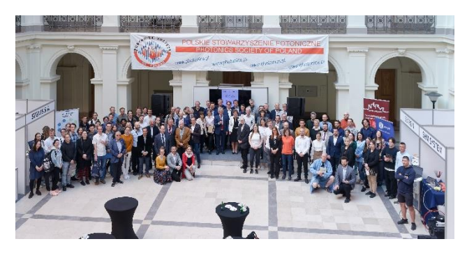
Fig. 1. 15th Anniversary Jubilee of Photonics Society of Poland participants.

Photonics Society of Poland (PSP) celebrated its 15th Anniversary on 12 May 2023 in the Physics Building of the Warsaw University of Technology. The Jubilee PSP Symposium was co-located with the 2nd International Photonics Job Fair and with the International Day of Light IDL-2023.