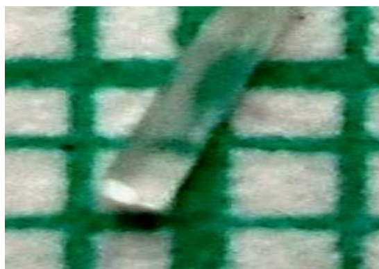
Fig.1.Single crystal X-ray diffraction.

The title compound was synthesized by benzoin condensation using 4g of KCN dissolved in 75cc of water in a one litre flask. To this was added 6.8g (0.05mole) of p-anisaldehyde, 7g (0.05mole) of benzaldehyde and 75cc of 95% ethanol. The mixture formed a solution at the boiling temperature and was refluxed for one and half hours. Steam was then passed through the solution until all the alcohol and nearly all the unchanged aldehyde was removed. The condensed water was decanted from the product and later set aside for crystallization. The product was then pressed as free as possible from oily material on a suction funnel and washed with cold alcohol. In this way about 8.1g (yield was 65%) of crude product was obtained. The crude mixture was dissolved in alcohol and allowed to crystallize slowly. The 4-methoxy benzoin crystallized out as lumps of long needles. The melting point of the compound was found to be 110°C .