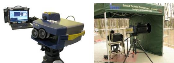
Fig. 1. The infrared imaging Fourier-transform spectrometer (IFTS) – Hyper-Cam.

The infrared imaging Fourier-transform spectrometer (IFTS) – Hyper-Cam LWIR – used on experiment was built by Telops Inc.. This IFTS use 320x256 pixel Mercury Cadmium Telluride (MCT) focal plane arrays (FPA) with a 6° x 5° FOV. The FPA has a Stirling cooler to provide good noise figures in a field ready package. Spectral information is obtained using a technique called Fourier Transform Infrared Radiometry (FTIR). FTIR is a classical interference based technique applied to gas spectroscopy that uses a Michelson interferometer to mix an incoming signal with itself at several different discrete time delays. The resulting time domain waveform, called an interferogram, is related to the power spectrum of the scene through the Fourier transform. An interferogram for each pixel in an image is created by imaging the output of the interferometer onto a focal plane array and collecting data at each discrete time delay. Advantages of using an FTIR sensor over a filter or grating based system include higher resolution for equal cost and the absence of misalignment of different color images due to platform motion. However, FTIR does have the disadvantage of producing a slower frame rate than filter based systems because twice as many points are taken for the same number of spectral points. For atmospheric tracking of gases, however, the LWIR sensor has a sufficient frame rate [4].