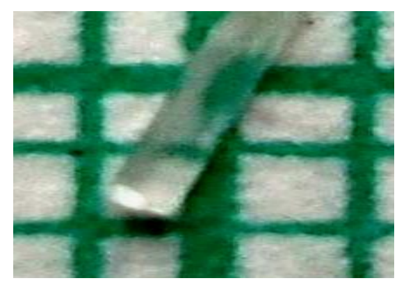
Fig.1.Single crystal X-ray diffraction.

The title compound was synthesized by benzoin condensation using 4g of KCN dissolved in 75cc of water in a one litre flask. To this was added 6.8g (0.05mole) of p-anisaldehyde, 7g (0.05mole) of benzaldeyde and 75cc of 95% ethanol. The mixture formed a solution at the boiling temperature and was refluxed for one and half hours. Steam was then passed through the solution until all the alcohol and nearly all the unchanged aldehyde was removed. The condensed water was decanted from the product and later set aside for crystallization. The product was then pressed as free as possible from oily material on a suction funnel and washed with cold alcohol. In this way about 8.1g (yield was 65%) of crude product was obtained. The crude mixture was dissolved in alcohol and allowed to crystallize slowly. The 4-methoxy benzoin crystallized out as lumps of long needles. The melting point of the compound was found to be 110°C.