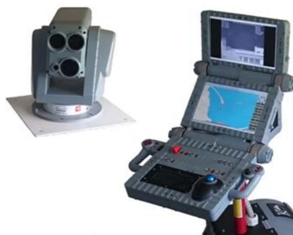
Fig. 1. Optoelectronic system for search and rescue mission control.

In the case of acquisition and processing of data