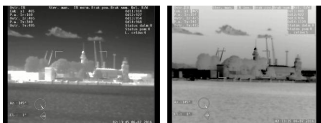
Fig. 4. Image from thermal camera taken while observing the ground infrastructure (normal and inverted polarization).

In conclusions, the paper presents the first stage of development of an optoelectronic system for maritime surveillance, especially for search and rescue applications. A specially manufactured optoelectronic turret equipped with visible light and thermal cameras, as well as a laser rangefinder have been integrated with an operator control desk and image acquisition software. Beside optoelectronic data receiving and processing, the developed system enables reception, processing and