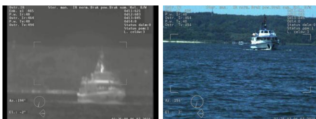
Fig. 3. Images of a vessel from thermal and visible light cameras.

A preliminary test of functionality of the developed system has been performed. The first stage of the test was carried out during work on the operator desk controller software. The final test has been performed on board of a research vessel S/Y Magnus Zaremba. The image from the thermal camera and that from the visible light camera operating in maritime conditions, as well as images from the thermal camera in normal and inverted polarization are shown respectively in Fig. 3 and 4.